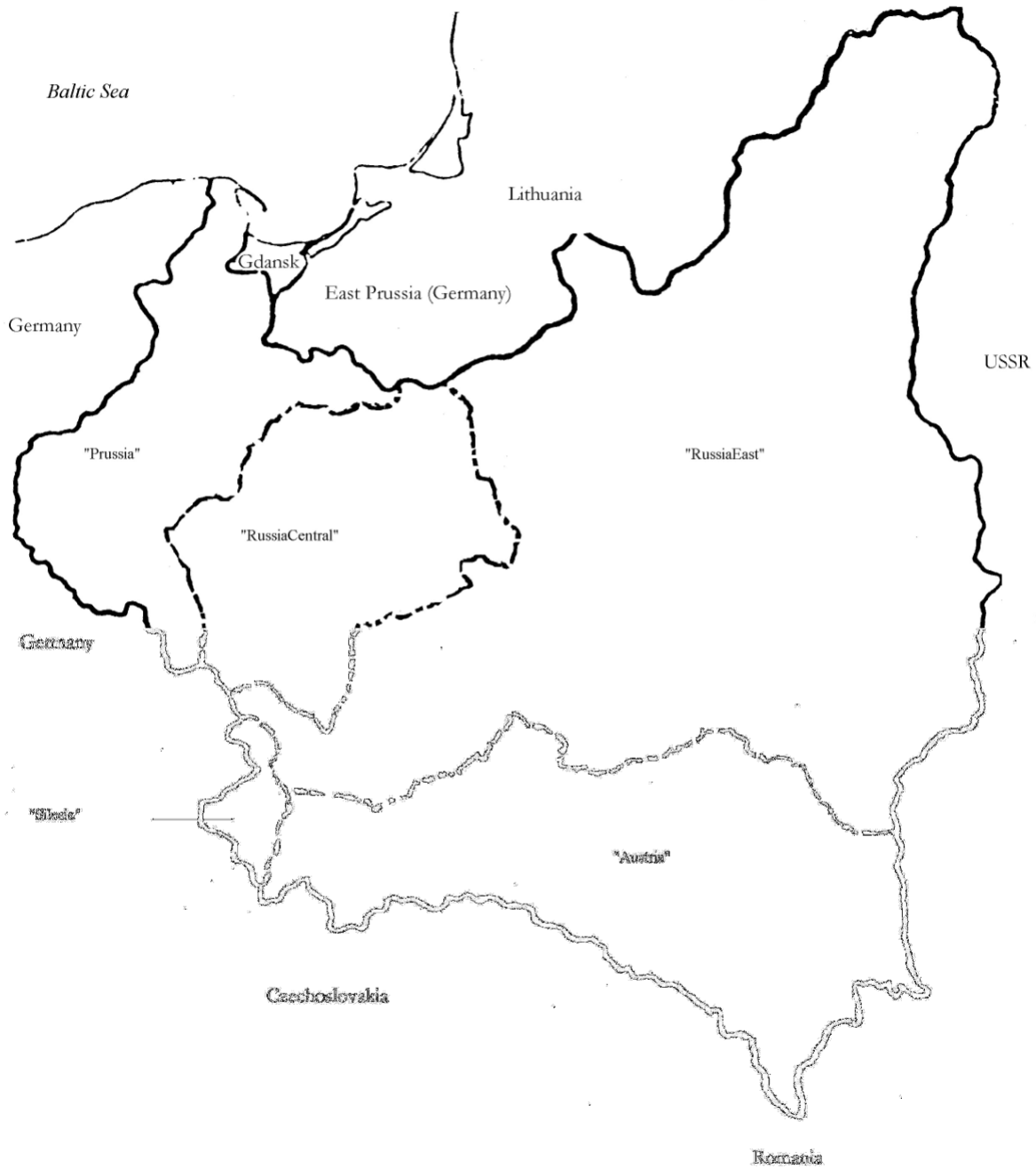
Map 3: Defining Five Big Areas

Based on Rocznik Statystyczny 1928, Warsaw (1929).