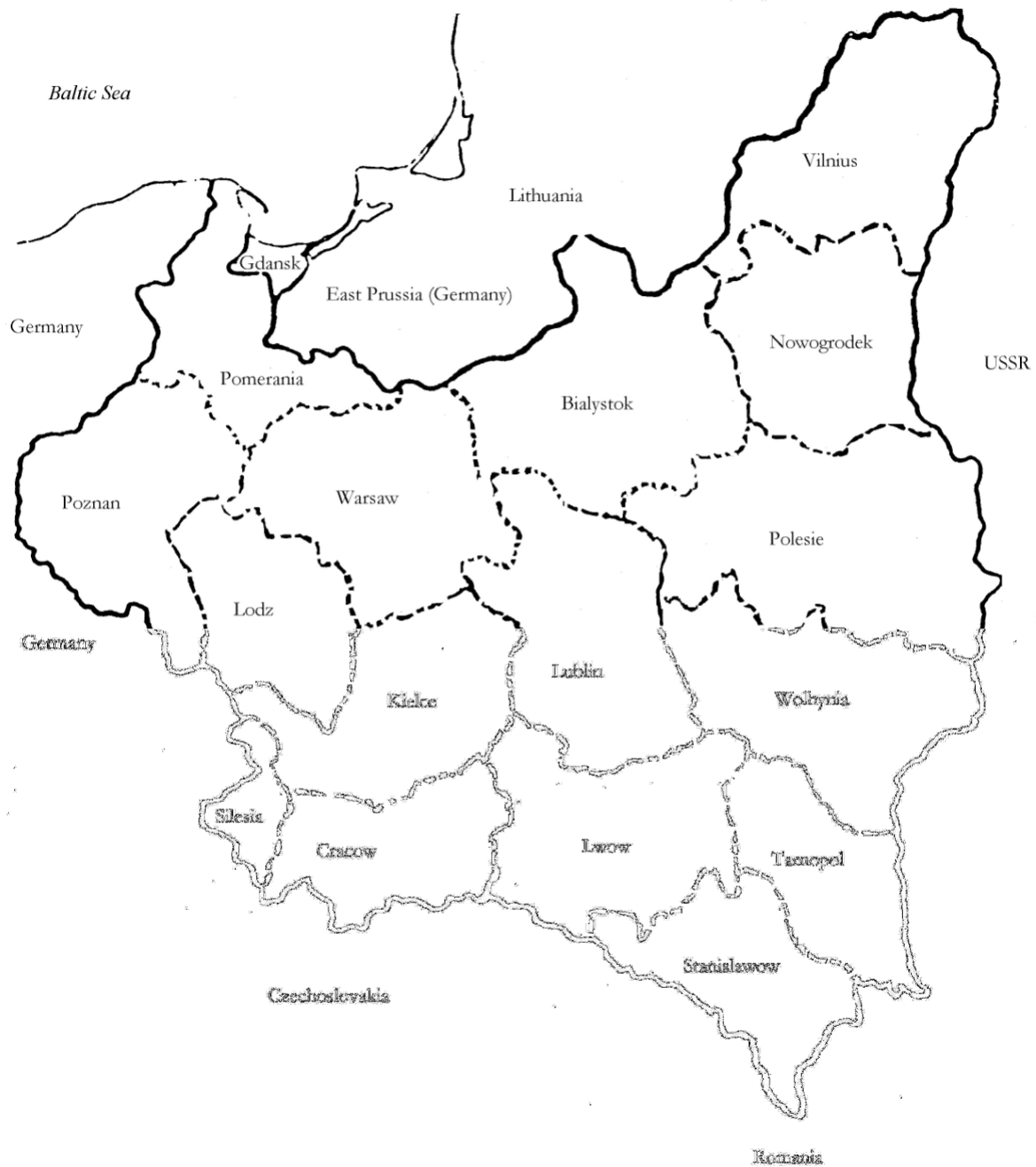
Map 2: Administrative Structure - Vojvodships (1921-1938)

Based on Rocznik Statystyczny 1928, Warsaw (1929).