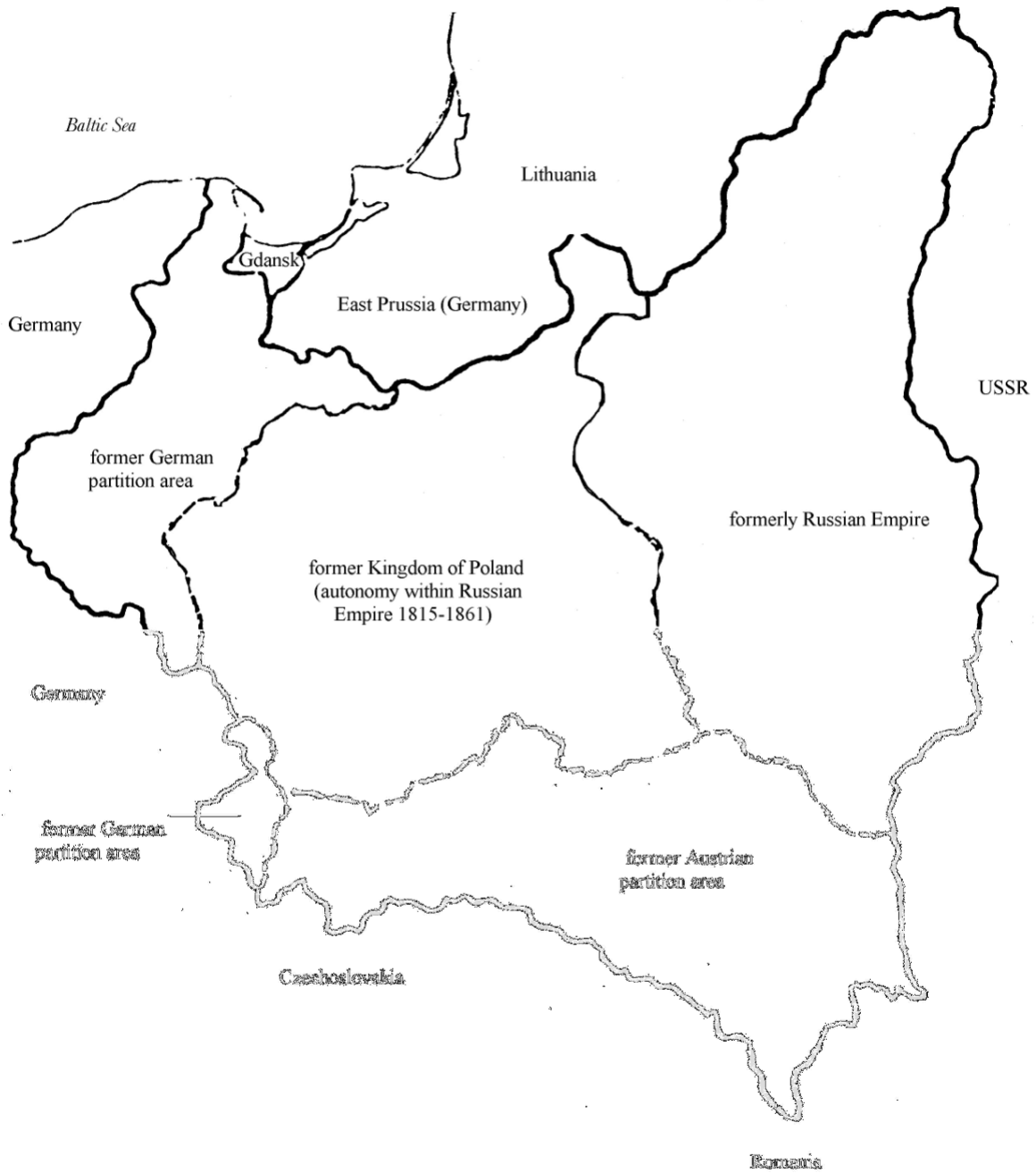
Map 1: Poland as in 1921 and the former partition borders

Based on Rocznik Statystyczny 1928, Warsaw (1929).