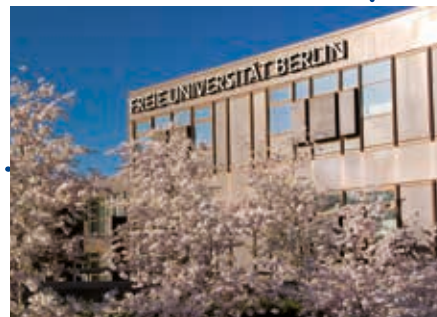
Design: Freie Universität Berlin, Center for Digital Systems